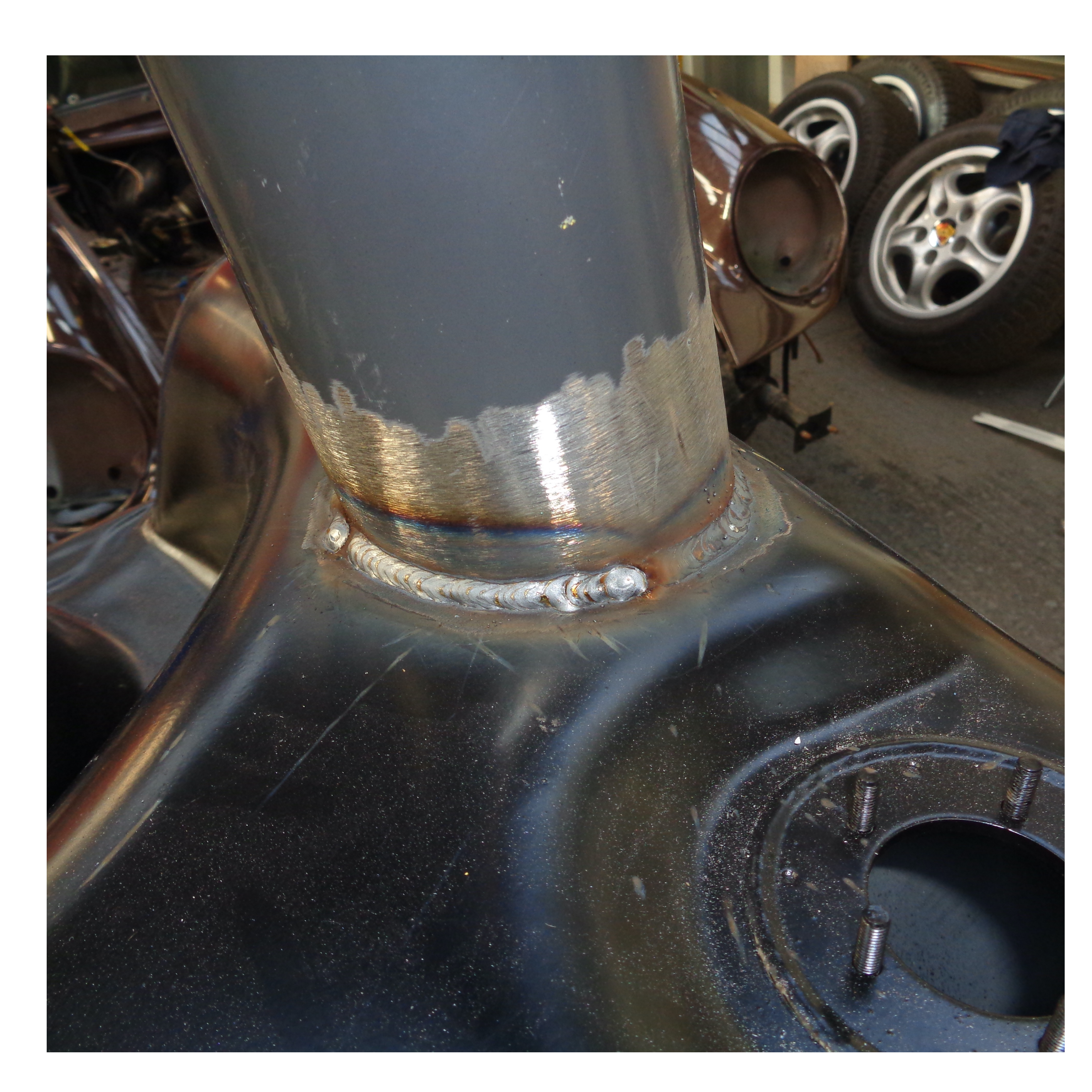
Weld the filler neck into position as per your measurements.