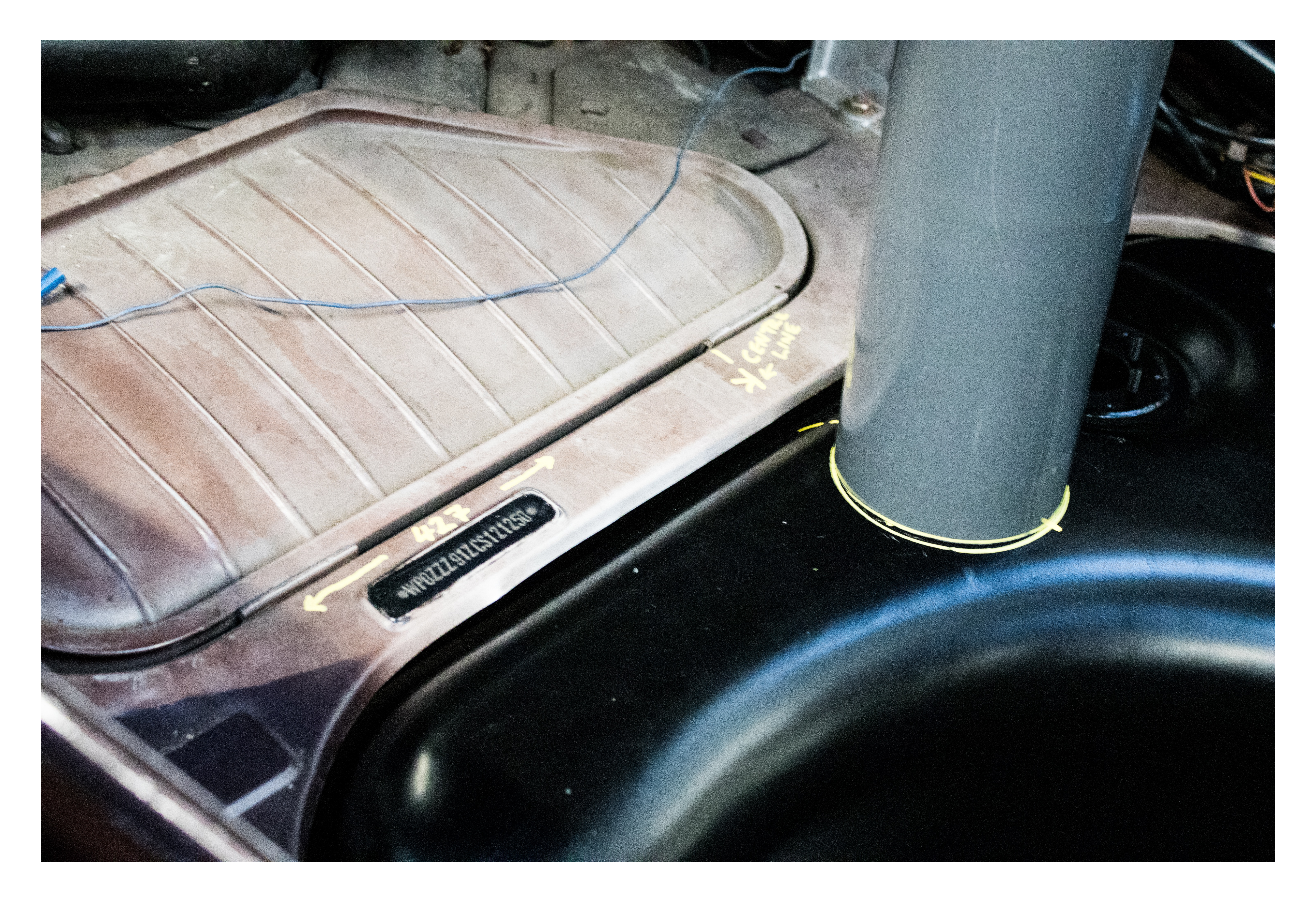
Reinstall the fuel tank with its fixings and follow the centre line on to the fuel tank. Rest filler neck on top of the fuel tank following the centre line and mark the hole to be cut.