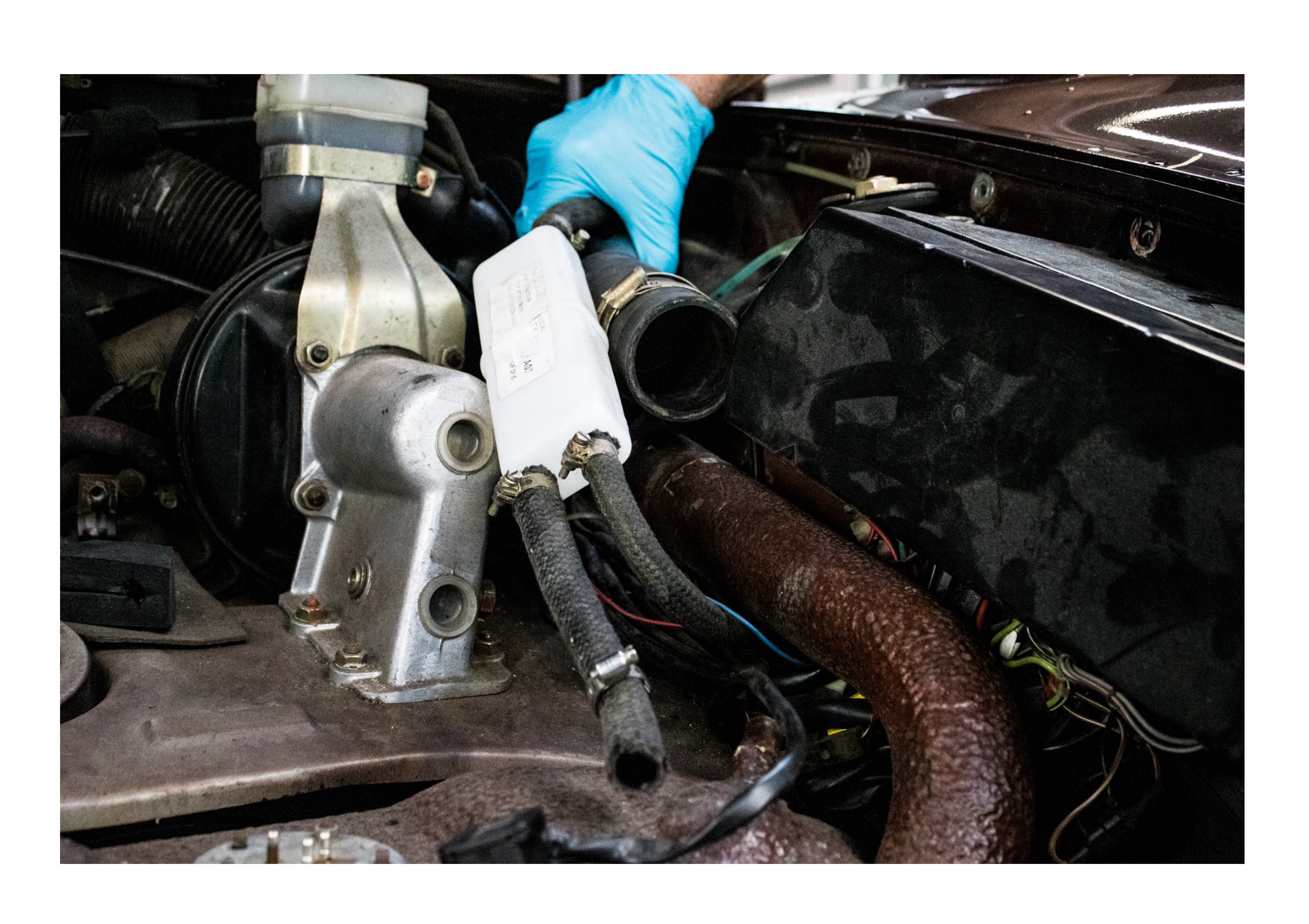
Remove the fuel breather system and filler neck connecting tube. Fuel tank slender unit wiring.