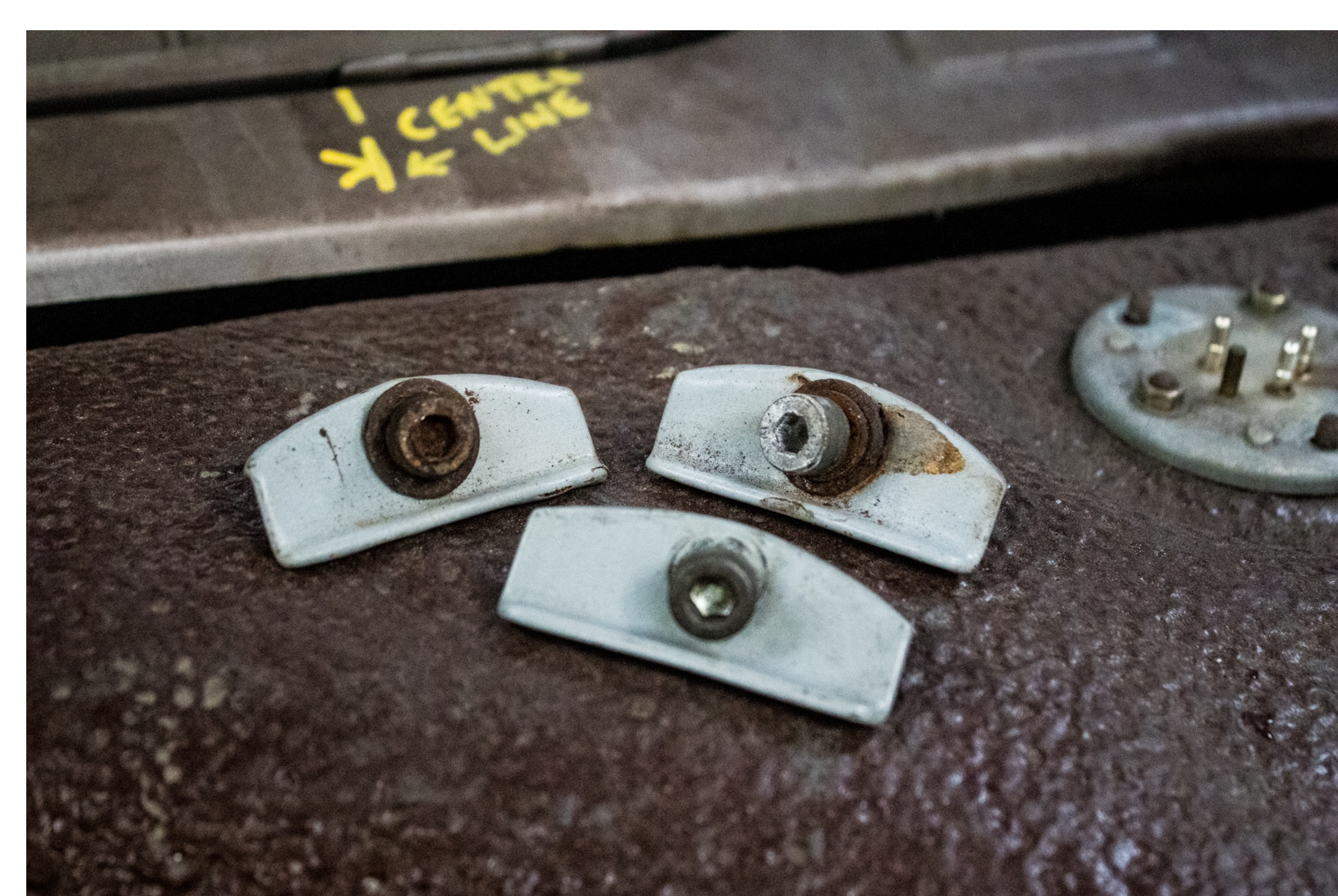
Remove the fuel tank fixings.