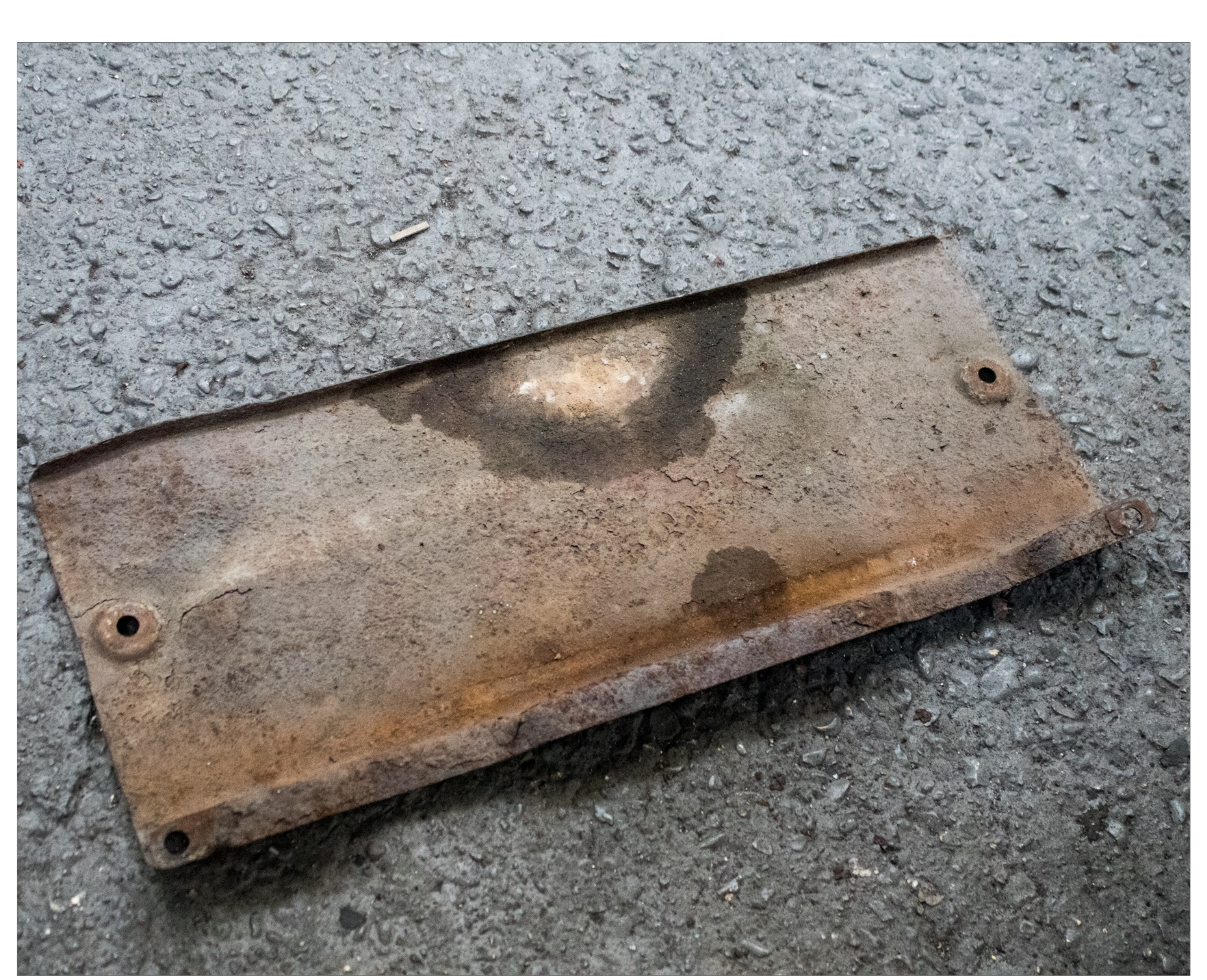
Shown here is the fuel pump cover removed.