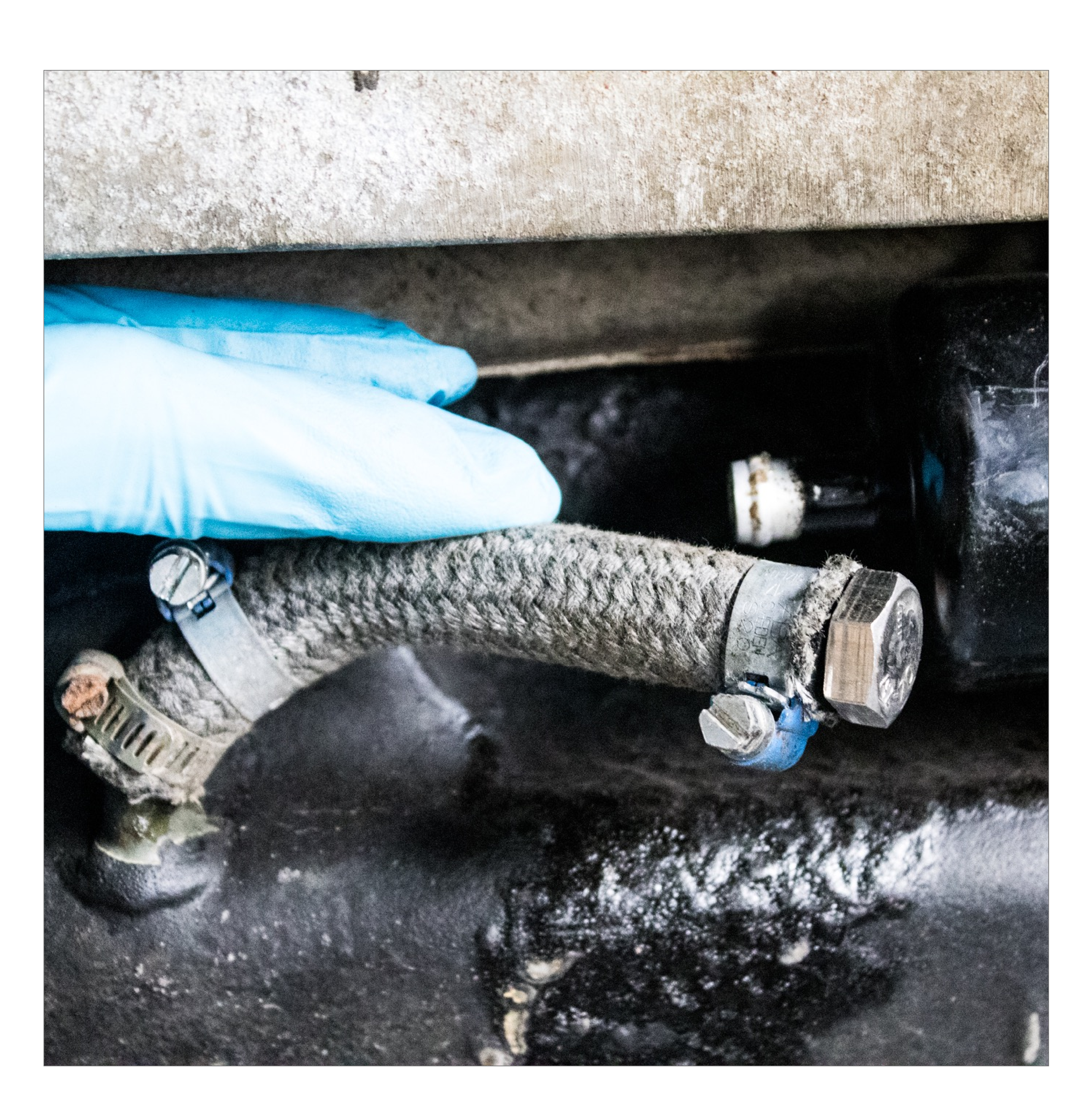
Plug off any pipes if possible, as some fuel residue may still spill from tank.