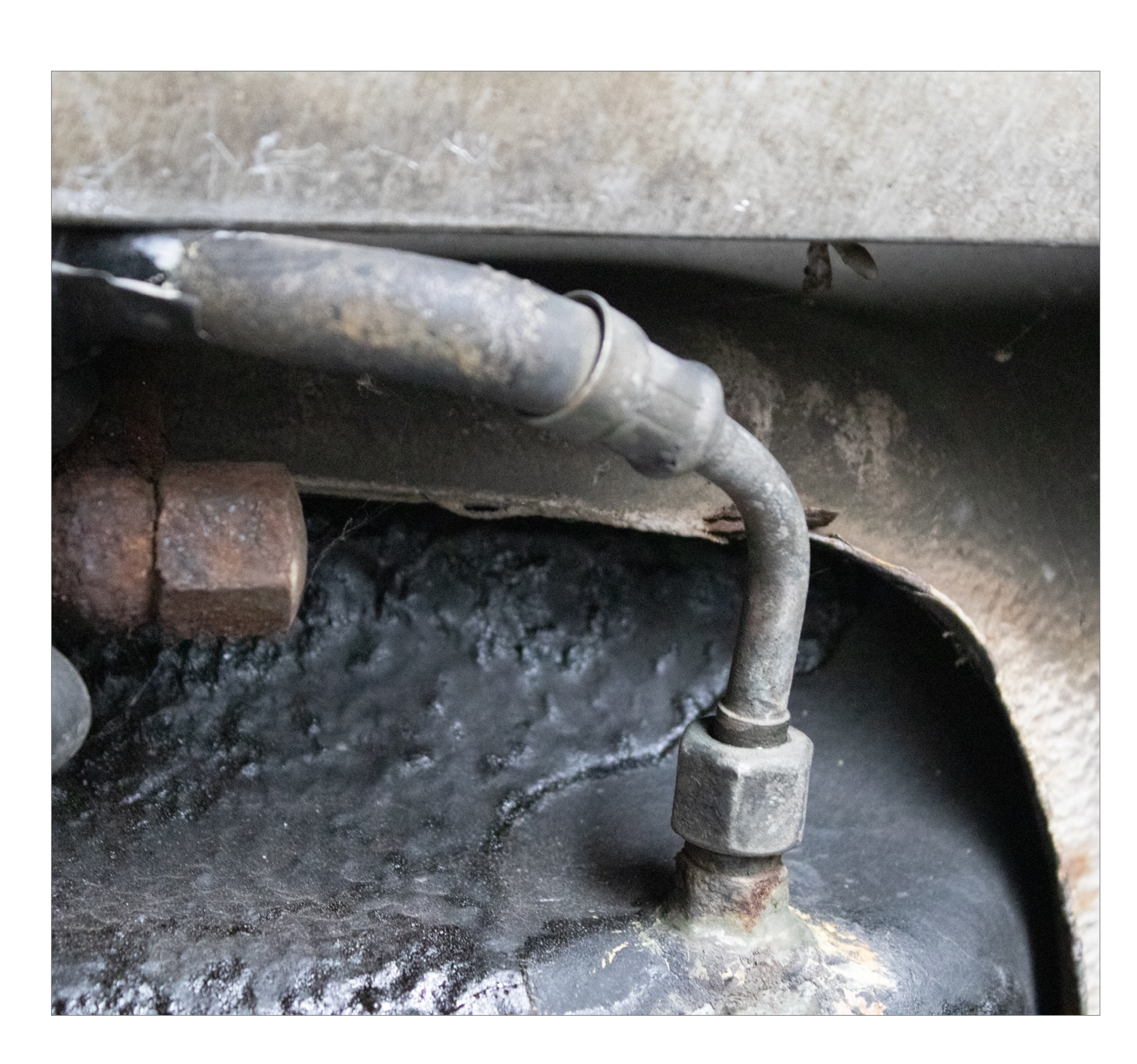
Remove the fuel return pipe as shown.